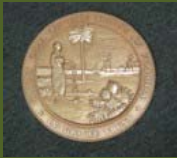
Bronze Ox Unmounted