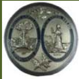
Silver OX with rim color Unmounted