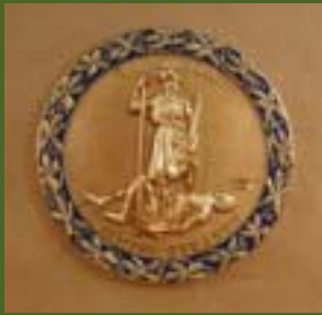
Dark Blue | PMS 280