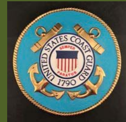
1001FC | U.S. Coast Guard 15" Butyrate Full Color Seal