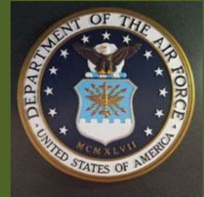
1029FC | Department of Air Force 15" Butyrate Full Color Seal