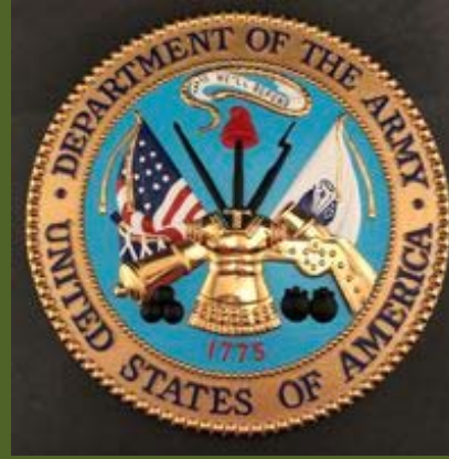
1158FC | Department of Army 15" Butyrate Full Color Seal