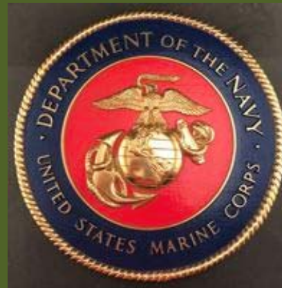
1158FC | DN_USMC 15" Butyrate Full Color Seal