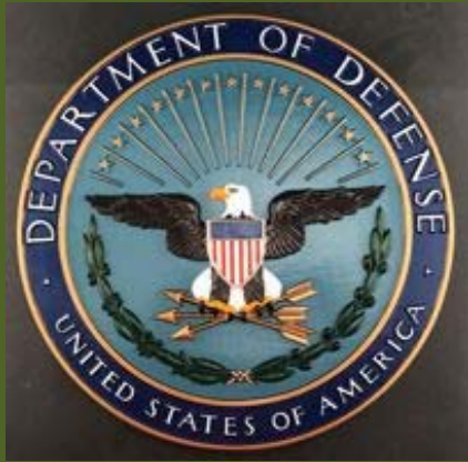
1413FC | Department of Defense 15" Butyrate Full Color Seal